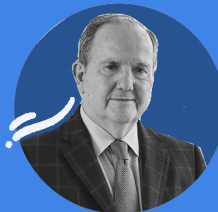
Juan E. Méndez

STATES REACHED OUT IN ADVOCACY MEETINGS TO SEEK SUPPORT FOR THE MÉNDEZ PRINCIPLES